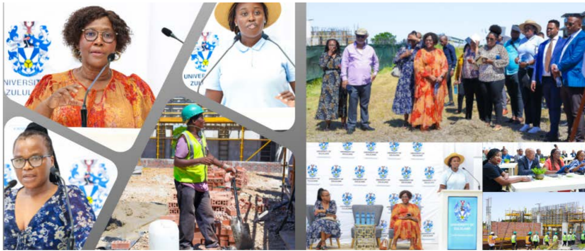
Sights of the Portfolio Committee on Higher Education, Science and Innovation's oversight visit at UNIZULU.