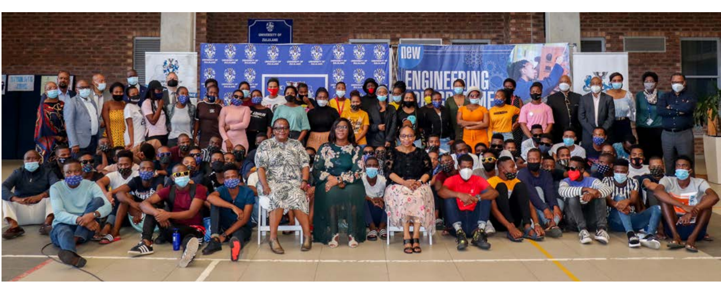
The University of Zululand has high expectations for its first class of engineering students. During a recent meet-and-greet session at the Richards Bay Campus, students were given a warm welcome by the university's executive management.