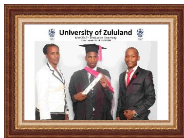
R100- each (One Framed A4 Photo)