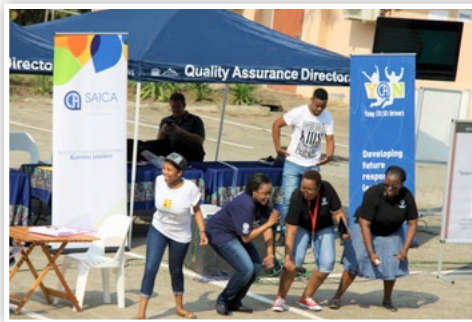
UNIZULU staff members during the SAICA Awareness event in October 2017.