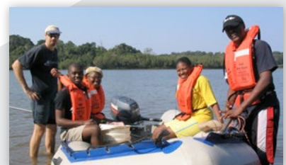
Department Profile: Department of Zoology