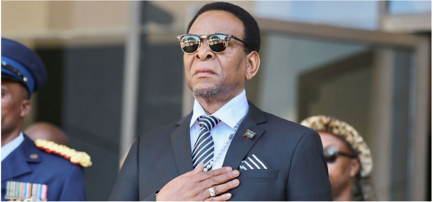
His Royal Majesty King Goodwill Zwelithini who will be honoured with an Honorary Doctorate in Social Work ( honoris causa ) in recognition of his extensive philanthropic work to alleviate poverty and sufferings amongst South Africans on Friday, 4 May 2018.

Monday, 7 May 2018, will see thousands of students from the University of Zululand descend the graduation stage during the University's May Graduation Ceremonies as they finally reap the fruit of their hard work and dedication.