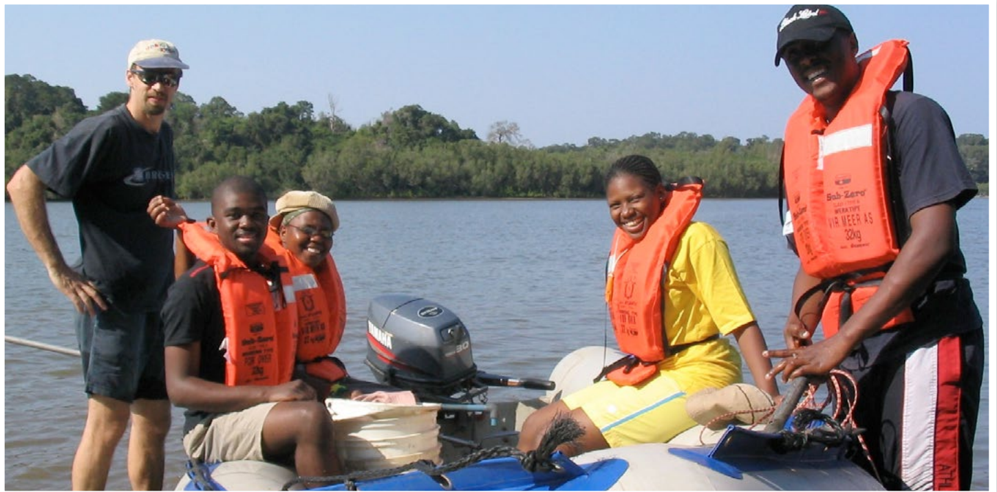
UNIZULU Zoology Department students during a training session.

The Zoology Department is one of 14 departments in the Faculty of Science and Agriculture and comprises a dynamic group of academics and support staff focused on providing excellence in Zoology undergraduate and postgraduate teaching and learning.