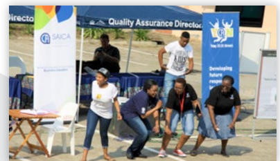
SAICA Accreditation for UNIZULU BCom Programme