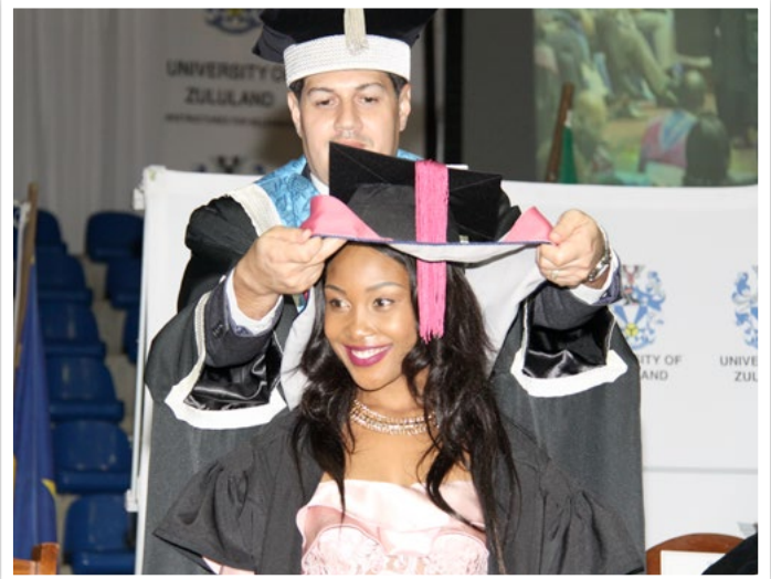
Pictured: A scene from the 2017 graduation ceremonies.

A total of 12 students will graduate with their Master's degrees in the Faculty of Science and Agriculture; 9 from the Faculty of