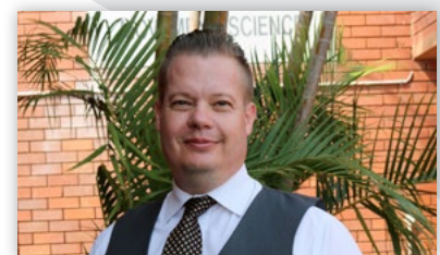
Seasoned Professor Joins Human Movement Studies Department