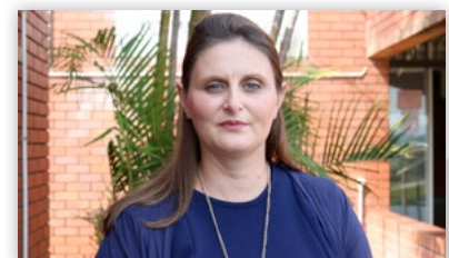
NRF-rated Researcher Appointed by Human Movement Studies Department