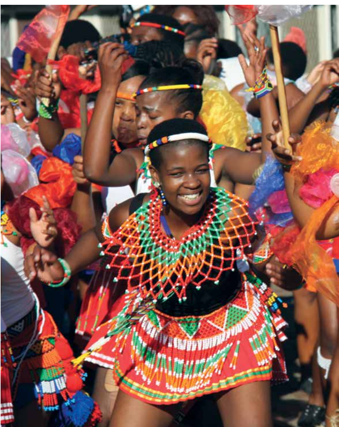
Members of the Ubuhle Besizwe students embarked on an HIV/Aids awareness programme on Campus. The group of maidens marched at the University of Zululand's KwaDlangezwa campus as they sought to encourage fellow students to abstain from sex. The awareness programme was held under the theme: "The role of culture in preventing HIV and Aids"

Apart from abstinence from sex, the Ubuhlebesizwe society also advocates for