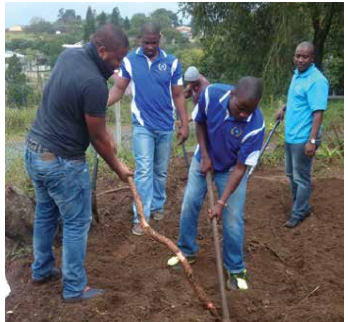
Members of GBR UNIZULU hard at work in a food garden at one of the local schools

the team also undertakes spiritual activities. "We do spiritual counselling, Bible studies and motivational speaking," he explained. This dedicated team also does charity work. They have donated jerseys to learners at Vulindlela. After seeing some learners there without shoes and some with different coloured shoes, the GBR UNIZULU team felt compassion for the learners. "We are looking into donating footwear to the learners". To get funding, GBR UNIZULU approaches various potential sponsors but most of the time members of the organisation find themselves having to dig deep into their pockets so as to be able to buy tools and make their tasks possible.