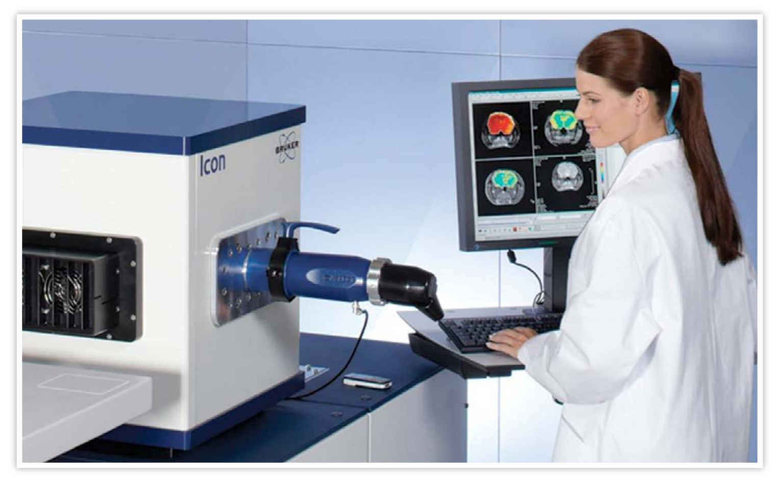
The Bruker MRI scan was recently installed on the KwaDlangezwa Campus premises for the mirco imaging of scientific specimens with small dimensions.

A new dawn has broken for the research and innovation sector at the University of Zululand following the procurement of a high-tech Magnetic Resonance Imaging (MRI) equipment which will aid in the micro imaging of internal and external morphology of scientific specimens of small dimensions such as mice, fruits, nanoparticles, polymer nanocomposites and complex polymeric blends.