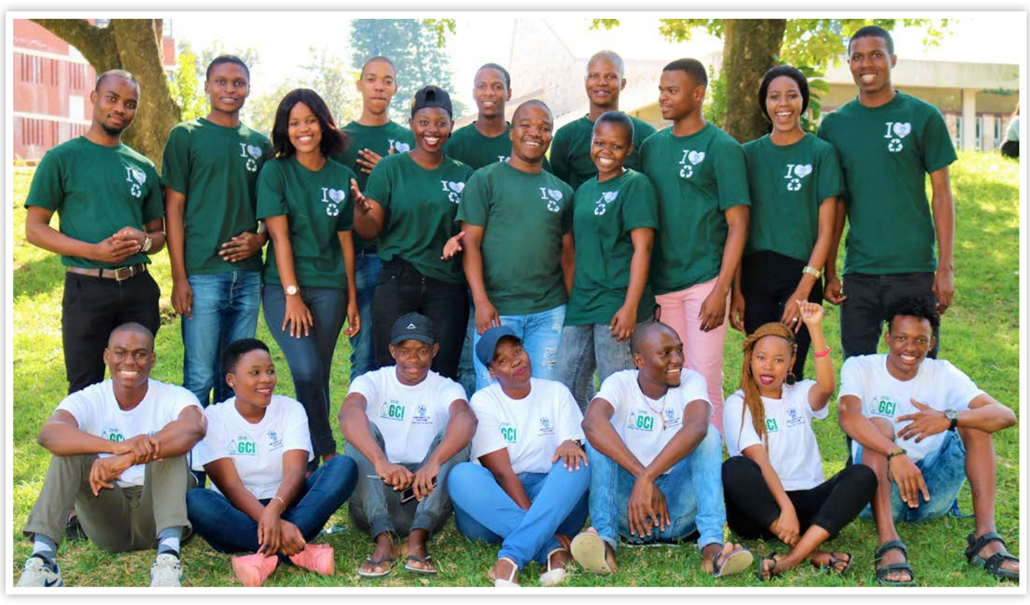
UNIZULU Green Campus Initiative (GCI) team.

Within a few months of the launch of the University of Zululand (UNIZULU) Green Campus Initiative (GCI) team, the green-conscious group received the Green Award for Water Saving during the 7th Annual Green Campuses Conference recently held at the Durban University of Technology.