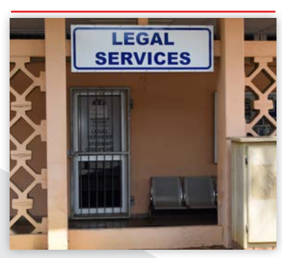
Legal Services Department