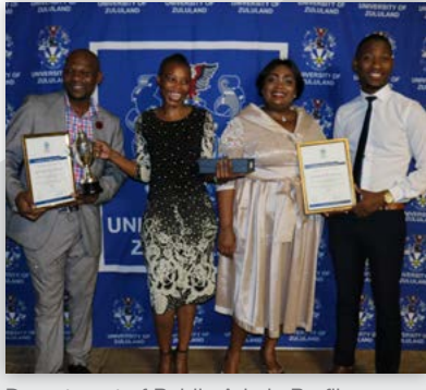
Department of Public Admin Profile