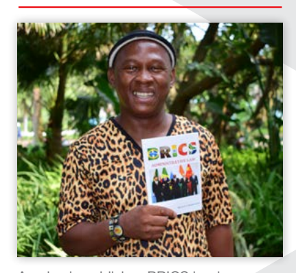
Academic publishes BRICS book