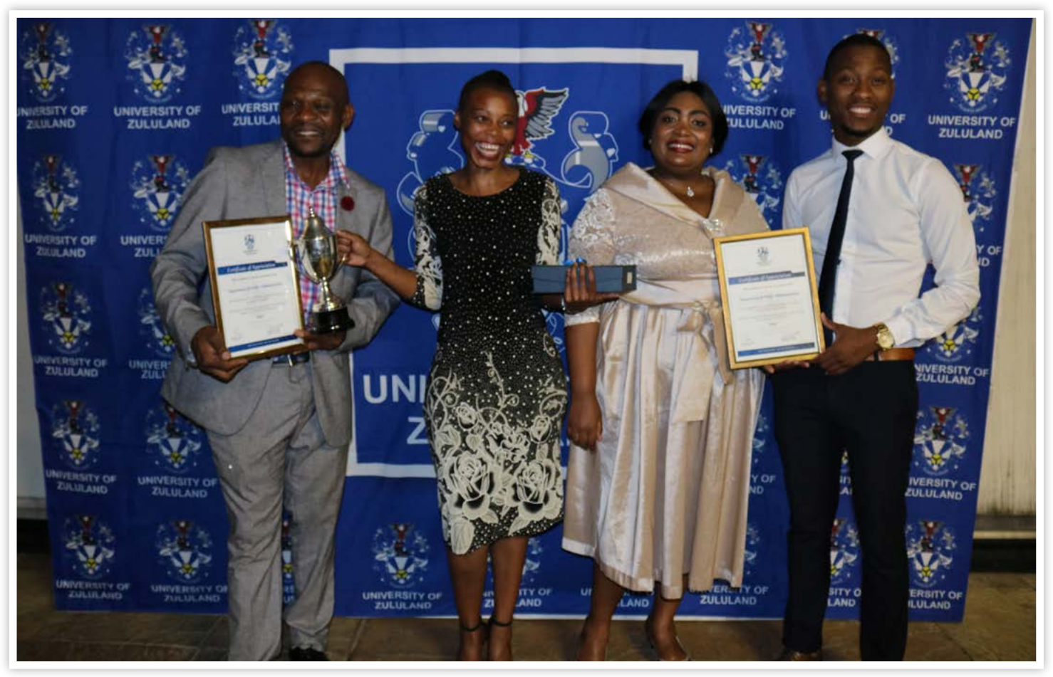
Public Administration Department staff after a night of notable victories during the 2018 UNIZULU Research and Innovation Awards.

The Department of Public Administration is one of five departments under the Faculty of Commerce, Administration and Law at the University of Zululand (UNIZULU). It is comprised of a team (three young and energetic academics and one support staff member) that is guided by the department's mission to provide quality education that helps build in students the characteristics of high intellect, moral integrity, responsible leadership, enlightened citizenship and human solidarity. At the core of the department's objectives is enriching the minds of its students with the most developed analytical and critical thinking approaches that transform them into leaders in the service of the community and essential interlocutors.