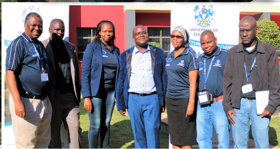
The organising team of the 2019 IGU CAS Conference.

The Department of Geography and Environmental Studies at the University of Zululand (UNIZULU) recently hosted its second International Geographical Union Commission on African Studies (IGU CAS) Conference at the Peermont Umfolozi Casino and Resort.