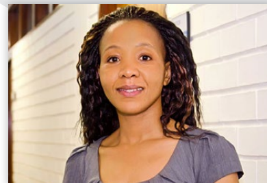
Design of Waterless Toilet Prototype in Progress