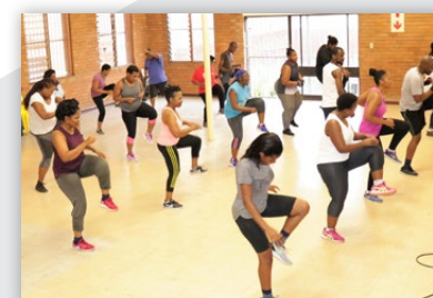
Your Wellness Matters