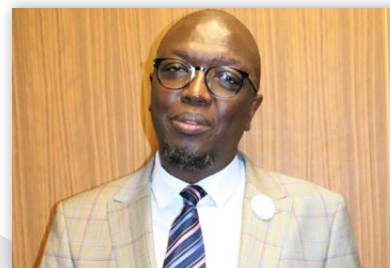
New Dean Eager to Transform Faculty of Arts