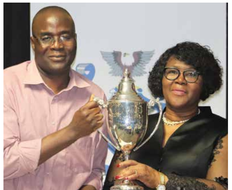
Umnyango we Politics and International Studies uklonyeliswe ngokuba umnyango ovelele ngokocwaningo kuma-Research Awards alo nyaka.

Uphethe ngokuthi uchazekile ngokuthi ukusungulwa kwale miklomelo kuwukhuphule kangakanani umthamo wocwaningo, kwandisa nababhali kule minyaka edlule.