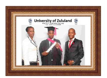
R100- each (One Framed A4 Photo)