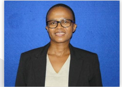
Towards a Community Engagement Centred University