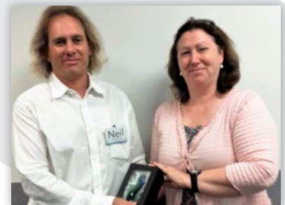
UNIZULU Researcher Scoops Top Award at International Conference