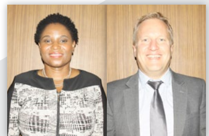
UNIZULU Appoints Two Executive Directors