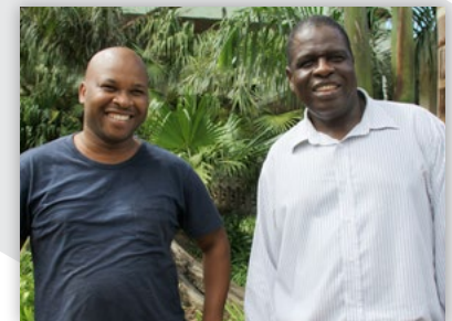
UNIZULU Academic Bags Funding for Binational Research Project