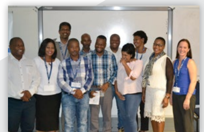
Work Integrated Learning Orientation Ensures Work-readiness of Students