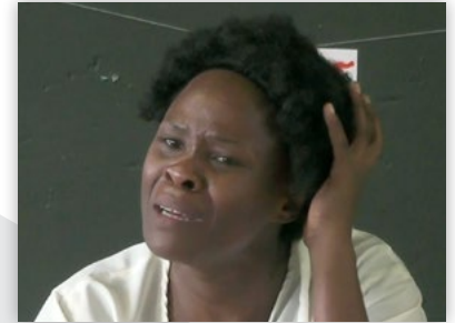
Acting Against Women and Child Abuse